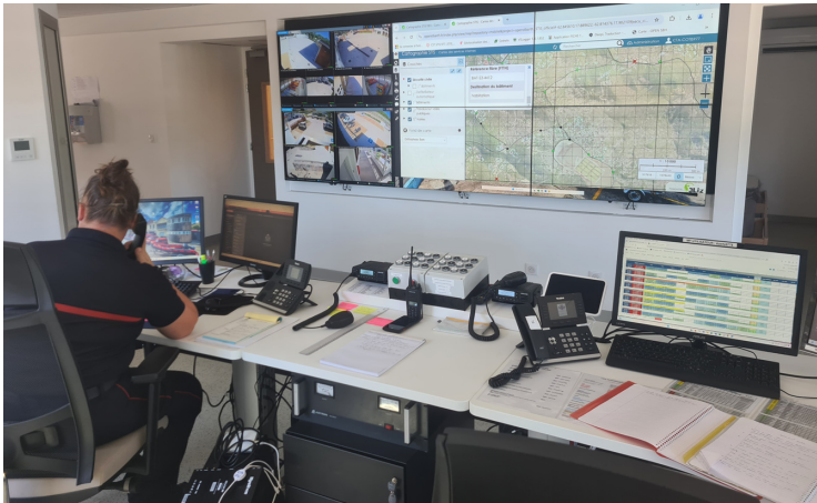
A modern call center with a fully computerized alert system.

In addition, another advantage of this system is that it subtracts kilowatt hours of solar energy from kilowatt hours of fuel oil. From an energy and environmental point of view, the island has everything to gain. “We need to move towards these solutions,” insists the director of DAC Antilles. The firefighters and rescue personnel are unlikely to contradict him.