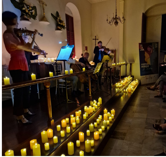
The Anglican Church played host to the Music Festival's annual candlelight concert.

To win the hearts of a younger audience, the festival works with the island schools: "A visit