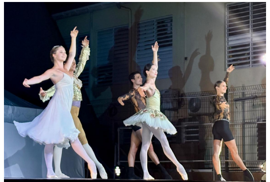
Dancers from the Paris Opera Ballet delighted audiences at the Ajoie plateau in Lorient.