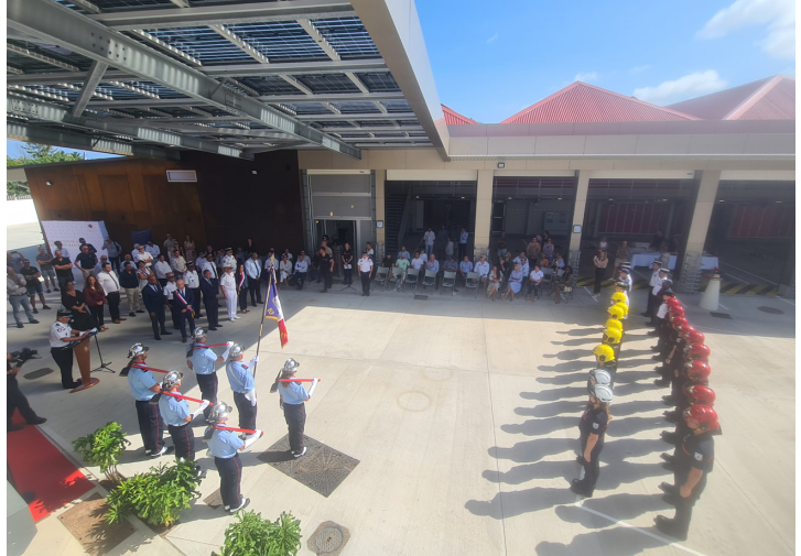
A new fire station for Saint Barth was inaugurated on Friday, January 10 in Saint Jean.

For one thing, the fire station will function, in part, with an internal energy network. In 2017, a competition for the most innovation design projects resulted in innovative propositions presented to the services of the Collectivity. These included a proposal from the DAC Antilles engineering firm, which