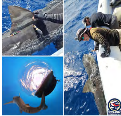
The first fishing of non-lethal tiger sharks took place in Saint Barthélemy as part of the One Shark project.

O n February 24, the Territorial Environmental Agency (ATE) posted online about the first non-lethal tiger sharks ( Galeocerdo cuvier ) caught in Saint Barthélemy, as part of the One Shark project. This was created after two incidents attributed to a tiger shark took place in December 2020 and January 2021 respectively in Saint Martin and Saint Kitts. “The One Shark project was founded to better understand the population of this species in the waters around Saint Barthélemy and Saint Martin,” explains the ATE. “The goal is to