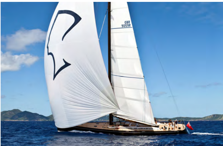
Nefertiti, one of the new entries in The Bucket this year.

For complete race details: bucketregatta.com