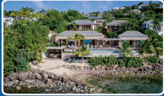
Villa LND Exceptional