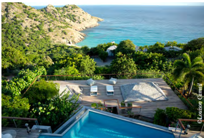
Villa Blue Dragon offered for sale exclusively by St. Barth Sotheby's.